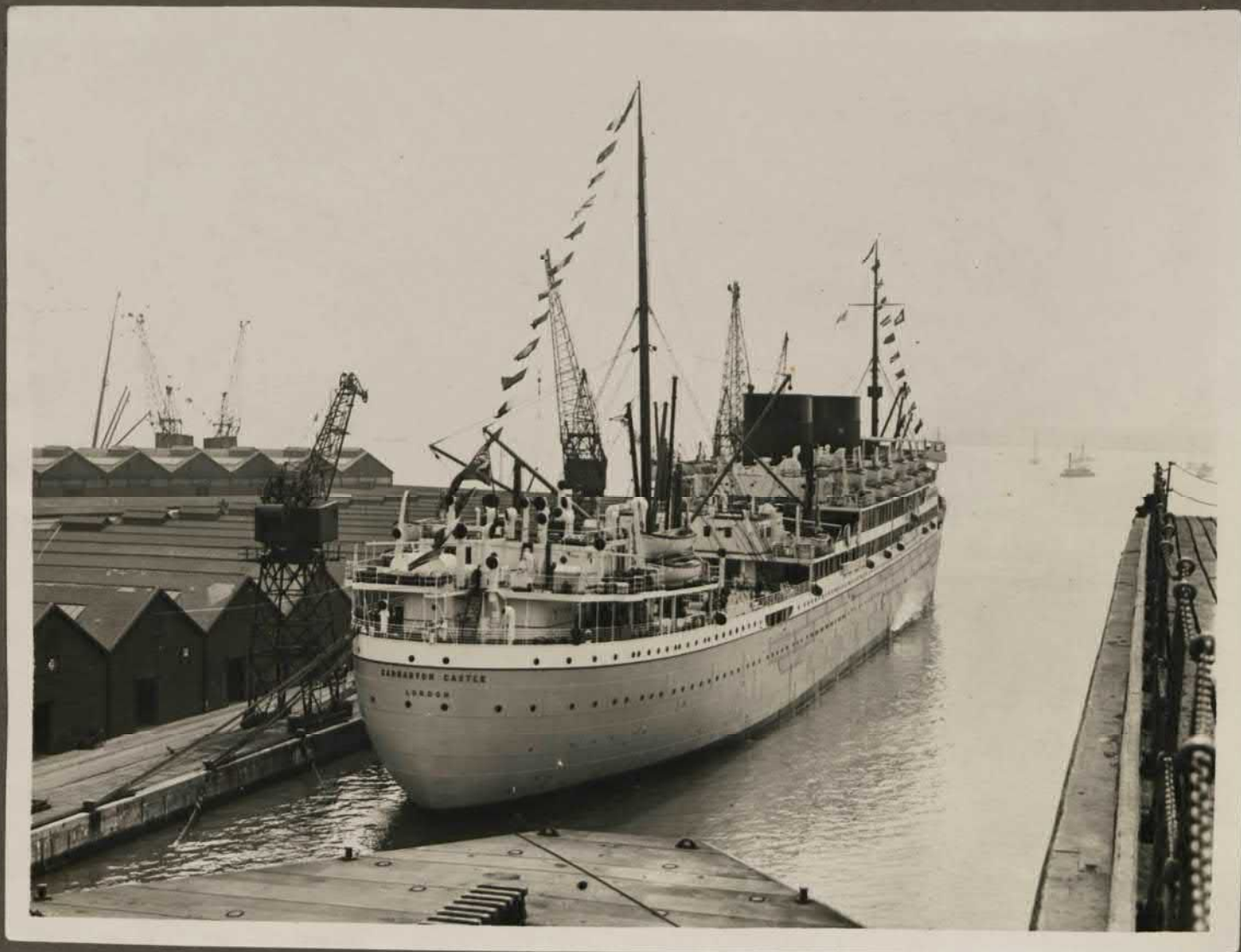
1. The R.M.M.V. "Carnarvon Castle". Southampton. May 24-1929.